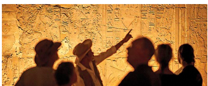
Exploring with Egyptologist

Please note: Program-specific terms and conditions are available at https://houscl.ahitravel.com/destinations/1822A?schoolld=711. You can also request a copy from our travel experts. Any payment to AHI Travel constitutes your acceptance of the terms and conditions set out therein, including but not limited to the cancellation terms.