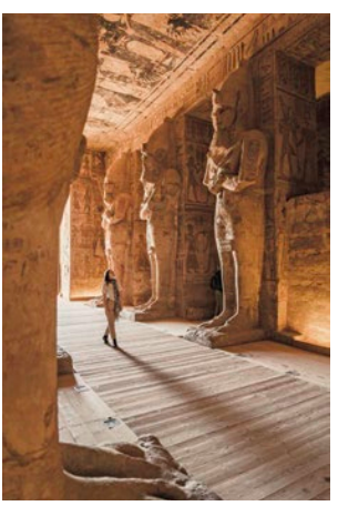
Temple of Ramses II, Abu Simbel