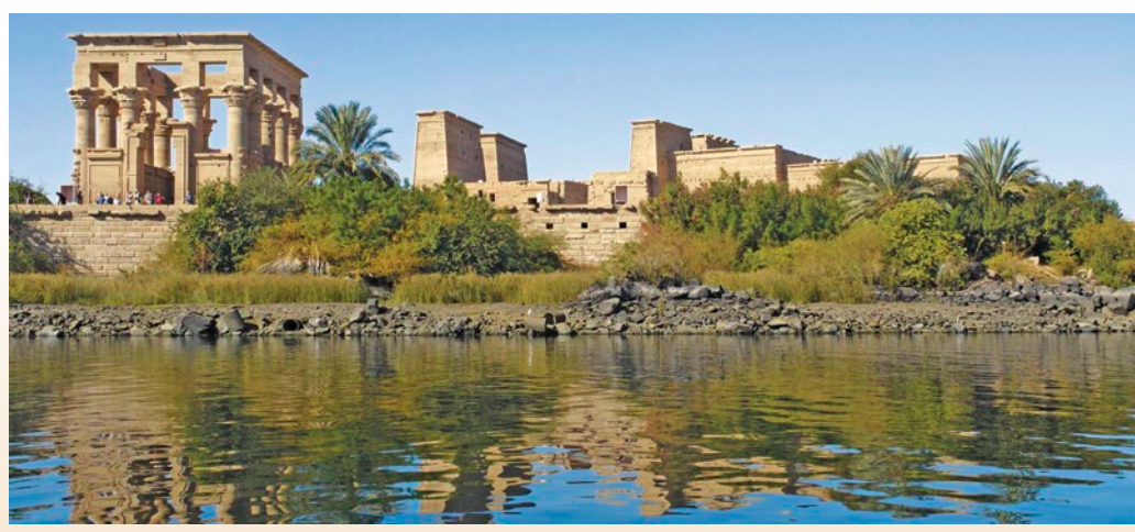
Temple of Philae

After docking in Aswan, fly to Abu Simbel. Abu Simbel. Visit the impressive Great Temple