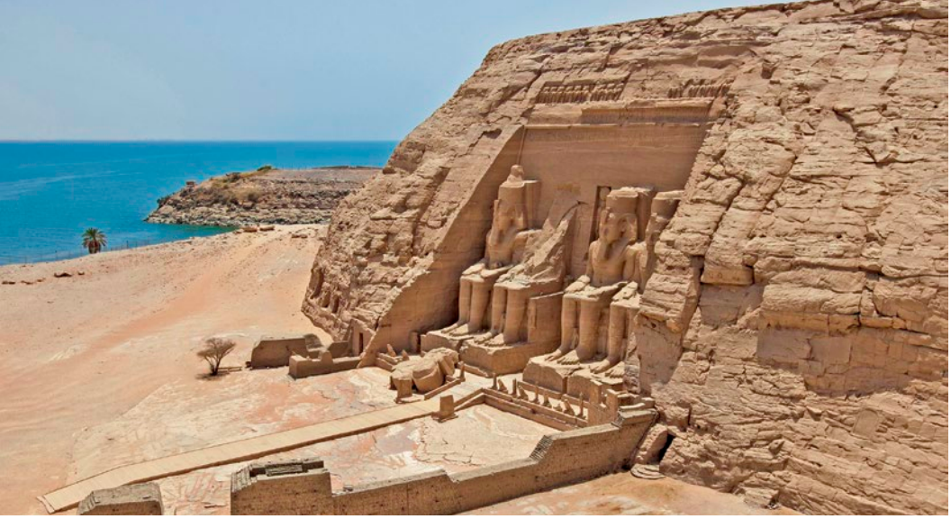
Temple of Ramses II, Abu Simbel

region where New Kingdom pharaohs and their families awaited immortality. Amazingly, the hieroglyphics adorning the walls of the tombs still spring to life with vibrant color. Go inside several tombs, including King Tutankhamen's tomb and the colonnaded Temple of Queen Hatshepsut. Afterward, stop at an alabaster workshop. Later, study superbly preserved murals in the tomb of Amun-her-Khepeshef, and see the majestic Colossi of Memnon.