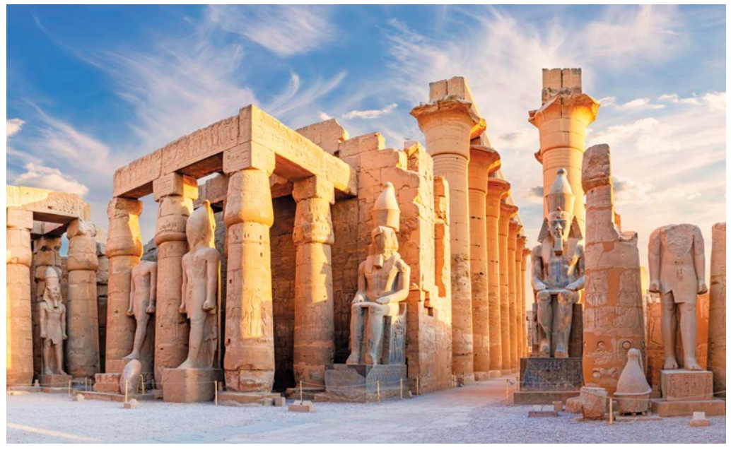
Temple of Luxor