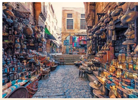
Khan el Khalili bazaar, Cairo

Luxor's West Bank — The Valleys of the Kings and Queens. Explore this spellbinding