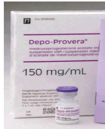
Depo Provera Injection