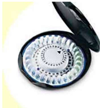
Birth Control Pills